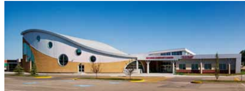
The Dawe Library offers services for all ages in a user friendly, inspiring and comfortable environment with Slimline and Singles shelves in an accordant birch finish. BCI has also delivered Page tables, Big Claus children's book browsers, and Malmö CD cabinets.