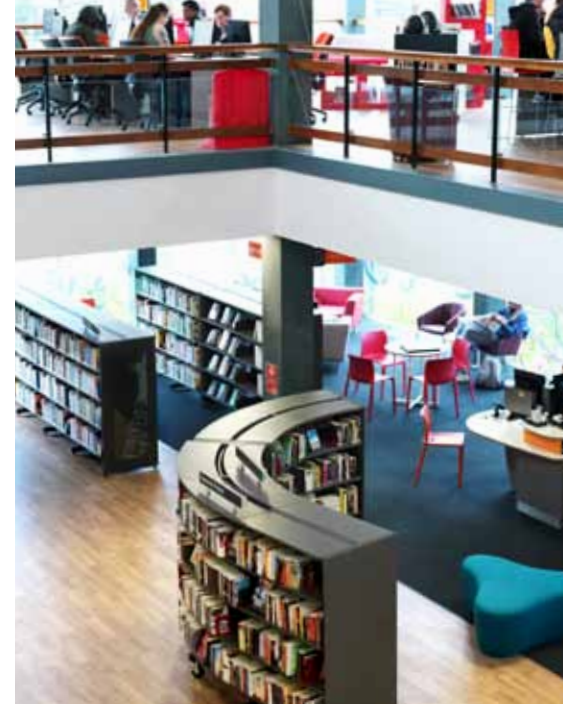
BCI 60/30 shelving system in Gothia grey with a textured finish on the shelves and the end panels was purposefully chosen to compliment the natural slate features in the building.

The library boasts state of the art technology with a specialist technology suite for blind and visually impaired people. There is also an area that is dedicated to local and family history where the use of Gothia Shelving with punched wooden end panels creates an environment that has a traditional quality about it whilst still maintaining the modern feel of the rest of the building.