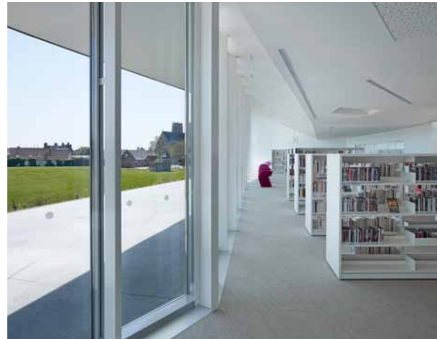
BCI's 60/30 steel shelving with London end panels and top shelving make the framework of the library.